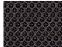
056.035 Graphitgrau Graphite