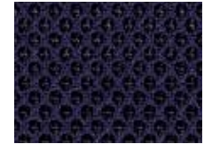
056.022 Dunkelblau Deep blue