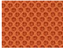
056.044 Orange Orange

Composition: 100% Polyester Weight: approx. 510g/m Width: 160cm Light fastness: value 5 (DIN EN ISO 105-B02) Pilling: value 5 (DIN EN ISO 12945/2) Fastness to rubbing: wet: 4 / dry: 5 Abrasion resistance: 70,000 rubs (Martindale; DIN EN ISO 12947-2) Flammability: DIN EN 1021: Part 1/2