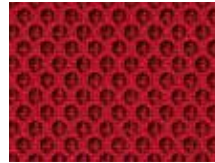
056.040 Chilliroth Chilli red