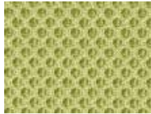
056.011 Hellgrün Vivid green