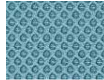
056.120 Hellblau Light blue