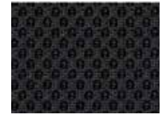
056.033 Schwarz Midnight black