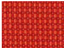
103.044 Orange Orange