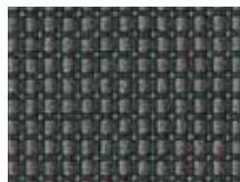
103.039 Javagrau Java grey