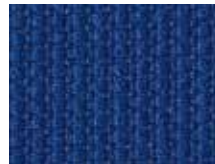
100.020 Standardblau Classic blue