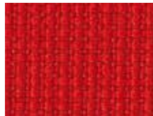
100.041 Feuerrot Züco red