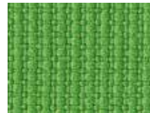
100.010 Grün Organic green