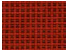
084.040 Chilliroth Chilli red