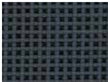
084.030 Grau Metal grey