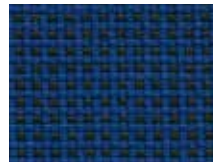
084.022 Dunkelblau Deep blue