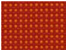
084.044 Orange Orange

Composition: 100% Trevira CS® (polyester) Weight: approx. 365g/m Width: 140cm Light fastness: value 6 (DIN EN ISO 105-BO2) Pilling: value 4–5 (DIN EN ISO 12945/2) Fastness to rubbing: wet: 4–5 / dry: 4–5 Abrasion resistance: 80,000 rubs (Martindale; DIN EN ISO 12947) Flammability: DIN EN 1021: Part 1/2, DIN 4102 B1, NF-P 92-503 class M1, BS 5852 IS 0+1, Crib 5, UN2 9175/87 (1. IM)