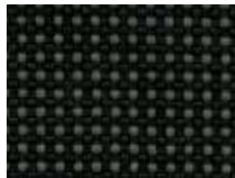
084.033 Schwarz Midnight black